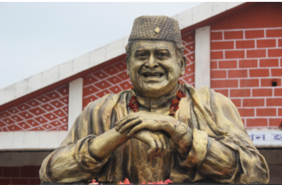
BUST OF BHARAT RATNA DR. BHUPEN HAZARIKA AT THE CAMPUS