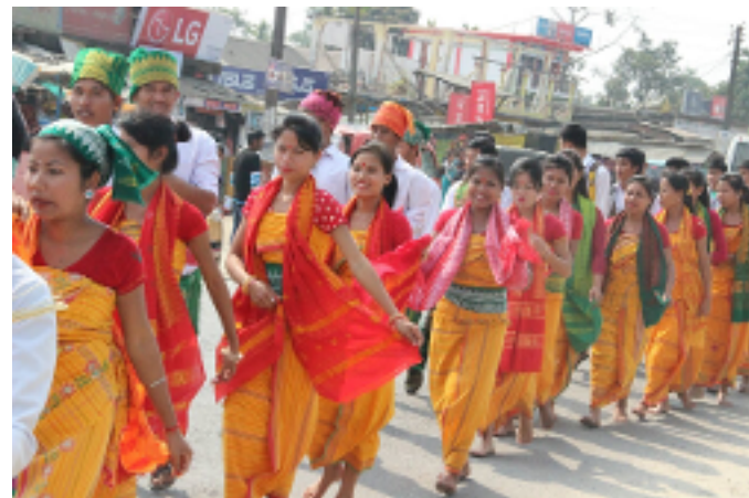
COLLEGE WEEK CULTURAL RALLY