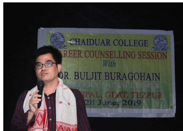
EMINENT RESOURCE PERSONS ADDRESSING STUDENTS AT INDUCTION, 2019