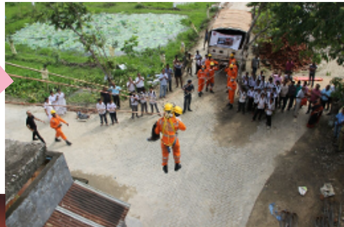
NDRF MOCK DRILL ON DISASTER MANAGEMENT