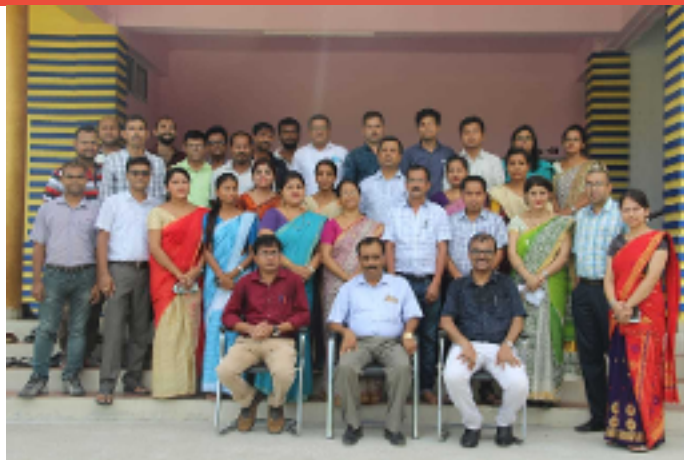
WORKSHOP ON ICT IN MANAGEMENT OF EDUCATION